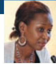
Immaculee Ilibagiza Rwandan Genocide Survivor, Author, and Speaker